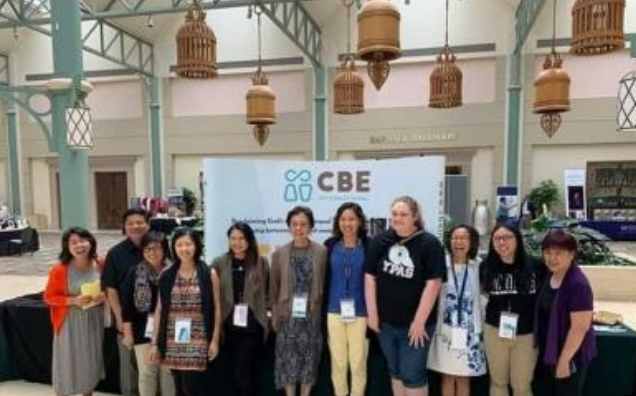
Staff Development CBE Keeps Us INCISIVE in what we do