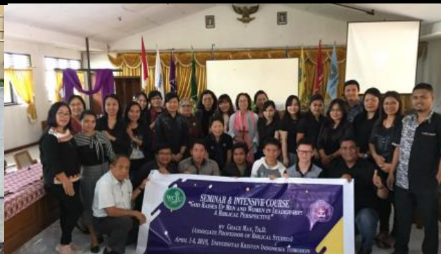
WOW's Teaching Reaches Indonesia