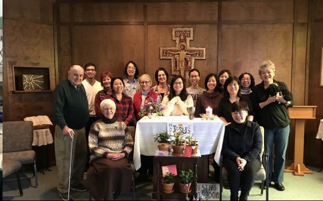
ReFresh Retreat REVITALIZING Relationships with God