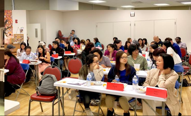
Monthly seminars Cultivating INTEGROUS living