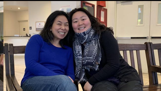
Launched Spiritual Direction To help others stay GRAVITAS