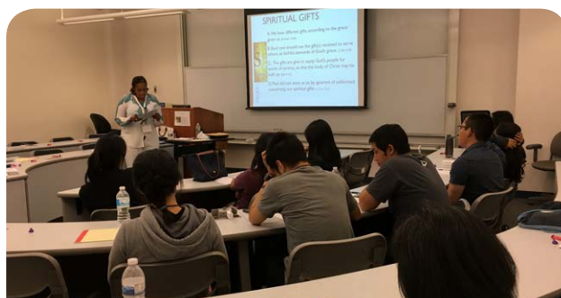
S.H.A.P.E. Workshop New York Summer Conference