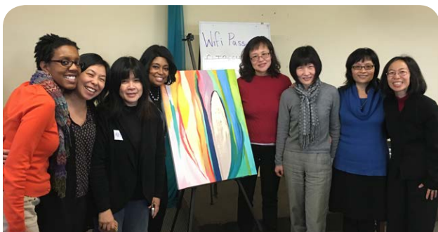
Woven Conference Emmanuel Gospel Center, Boston