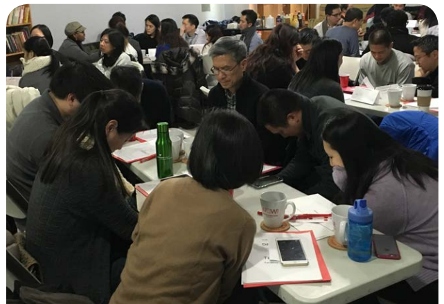
Gifts and Calling Workshop Oversea Chinese Mission