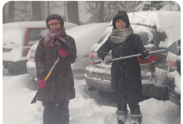
Women of Grace, OCM Grace Church