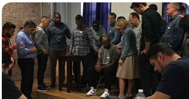
Women and Church Planting