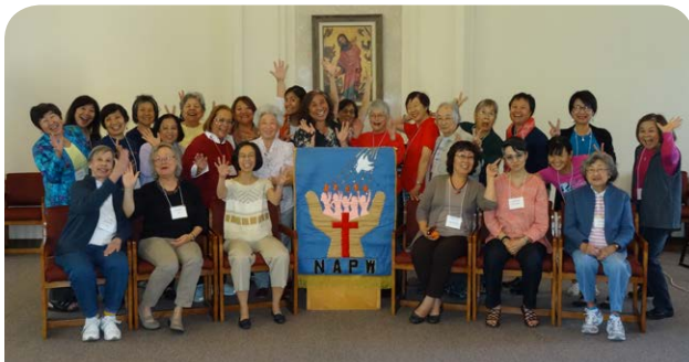
Gathering of National Asian Presbyterian Women