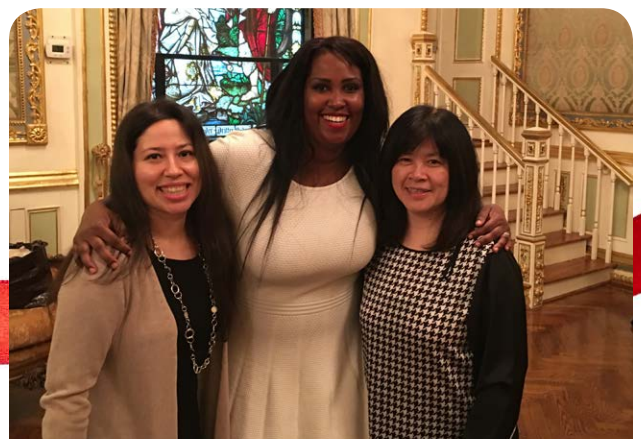
Christian Women in Media