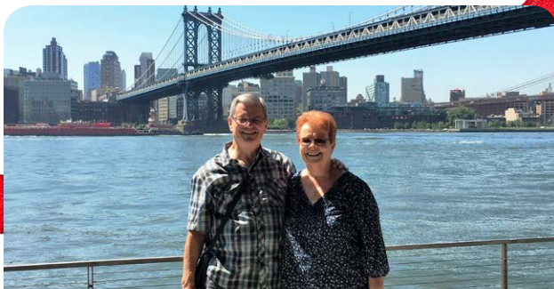
WIT Planning Meeting