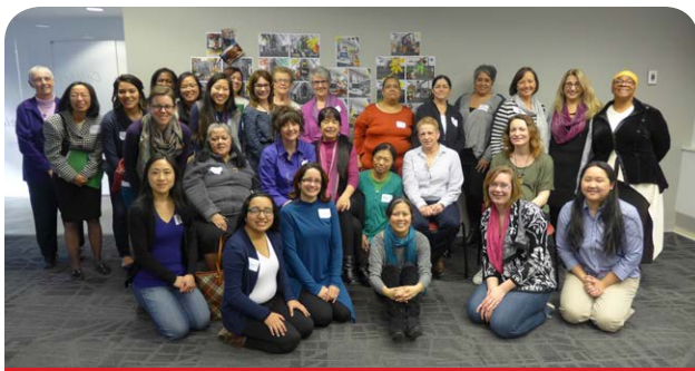
Symposium on Women in Leadership and Ministry, City Seminary of New York