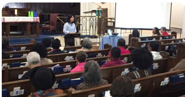
Presbyterian Women of NYC