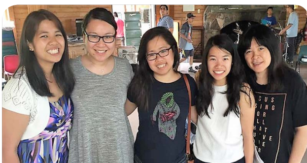
Teen ECBC (Eastern Chinese Bible Conference)